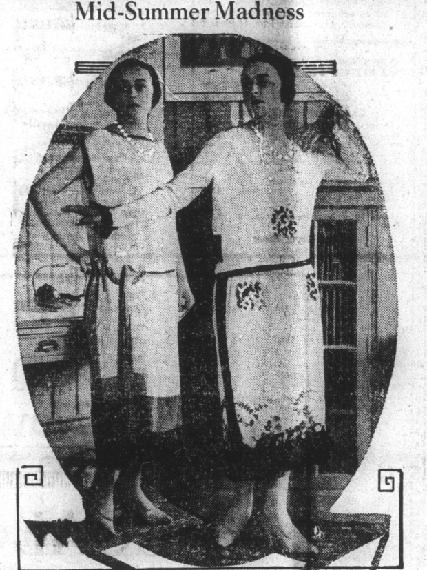
These two midsummer gowns stress lines rather than trimming. Both are of white crepe de chine, and both are as simple in effect as it is possible to make them, but they are subtle, too, in their discrimination.

Philadelphia Record. These two midsummer gowns stress lines rather than trimming. Both are of white crepe de chine, and both are as simple in effect as it is possible to make them, but they are subtle, too, in their discrimination. The long-sleeved model is embroidered in black chenille and banded with black velvet. The sleeves model has three unics in different shades of green that form a border about the neckline. It is bound at the neck and armholes with the darkest shade of green and a tassel of just that size falls from the waistline nearly to the hemline.