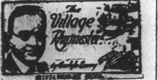
Dear Folks: To sympathize with other folks will often help a bit, 'twill often help to ease a pain when somebody is hurt.

When thou passest through the waters, I will be with thee; and through the rivers, they shall not overflow thee.