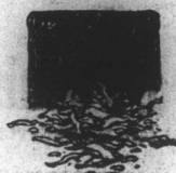
Rough Cut, for pipes only