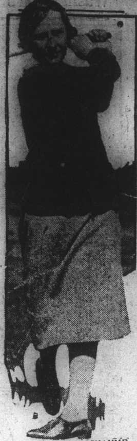
SIMONE DE LA CHAUMÉ

THIS young lady of France, Mlle. Simone de la Chaumé, has flashed across the golf heavens as did Suzanne Lenglen in a few years ago. She showed well in the French open ladies' golf championship at the age of 14, and has been winning ever since.