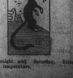
Fair tonight and Saturday, little change in temperature.

Battle of Shanhikwan Continues. Tien, Tsin, China, Oct. 17 (By the Associated Press).—The battle of Shanhikwan continued unceasingly today. Shanhikwan itself suffered considerable damage from the bombardment of the Manchurian troops seeking to make a permanent capture of the key border town.