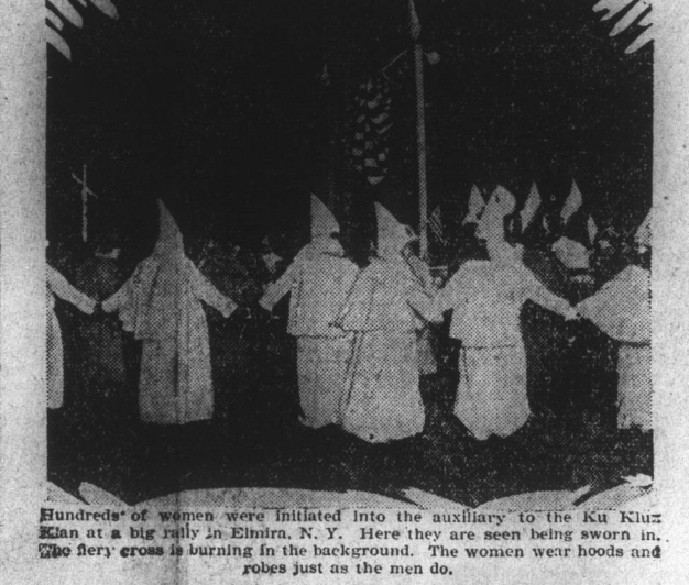
Hundreds of women were initiated into the auxiliary to the Ku Klux Klan at a big rally in Elmira, N. Y. Here they are seen being sworn in. The fiery cross is burning in the background. The women wear hoods and robes just as the men do.