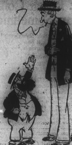
The Long and the short of it is you save money by trading here