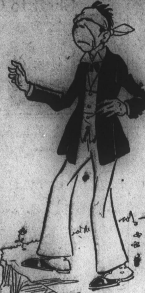
Bargains a Blindfolded Man Can See