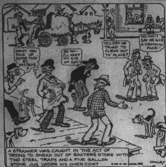
A STRANGER WAS CAUGHT IN THE ACT OF TRYING TO SNEAK OUT OF BAXTER'S STORE WITH TWO STEEL TRAPS AND A FINE GALLON STONE JUG UNDER HIS OVER COAT