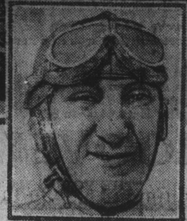
At top "Cannon Ball" Baker in his car ready for a record breaking run; and below, just "Cannon Ball" Baker.

THE first photograph of the middle west tornado disaster to reach Los Angeles, Cal., newspapers were brought over the last lap of 212.9 miles by Cannon Ball Baker in a Rickenbacker car, equipped with Kelly balloon tires, driving on the tortuous, mountainous highway between San Luis Obispo and Los Angeles in black night. He broke the inter-city record. His time was 4 hours and 24 minutes, an average of 48.4 miles per hour. And this over a zig-zag highway with scores of hairpin turns which were taken at 45 miles per hour without slipping or skidding. Baker left San Luis Obispo at 7:45 a.m. and reached Los Angeles at 11:09 a.m.