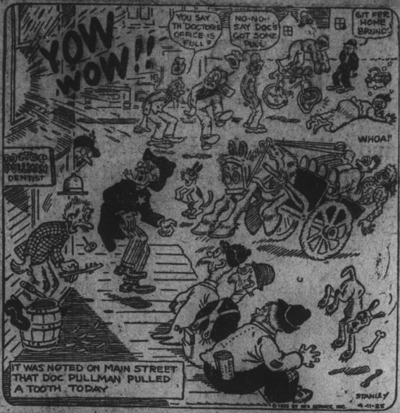
IT WAS NOTED ON MAIN STREET THAT DOC PULLMAN PULLED A TOOTH TODAY