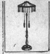
Polycrome stands. Weighed. base. Silk shades with silk lining and fringe. A good buy at $16.50. $22.50 JR. LAMP $16.75

No lamps will be sold at the above prices before nine o'clock Monday morning. Only one to a customer. No phone orders.