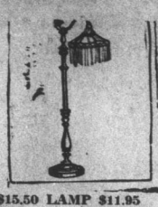
Beautiful polycrome stand. All silk shade, silk lining and silk fringe. $15.50 LAMP $11.95