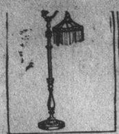
$15.50 LAMP $11.95

$3.50 LAMP $1.95 Iron stand, paper shade and cord, complete. No phone orders.