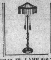
$22.50 JR. LAMP $16.75 Polycrome stands. Weighed base. Silk shades with silk lining and fringe. A good buy at $16.50.

No lamps will be sold at the above prices before nine o'clock Monday morning. Only one to a customer. No phone orders.