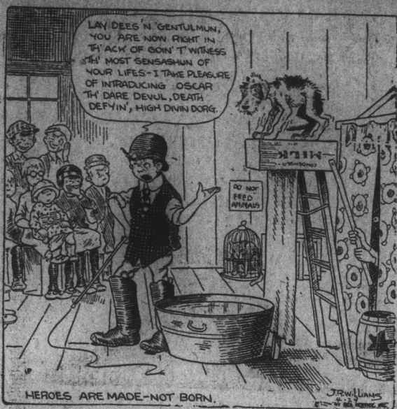
HEROES ARE MADE—NOT BORN.