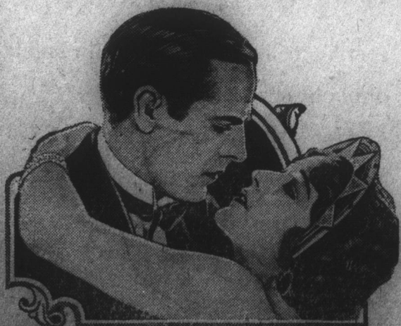
Antonio Moreno and Aileen Pringle in "One Year to Live" At Concord's New Theatre Today and Tomorrow.