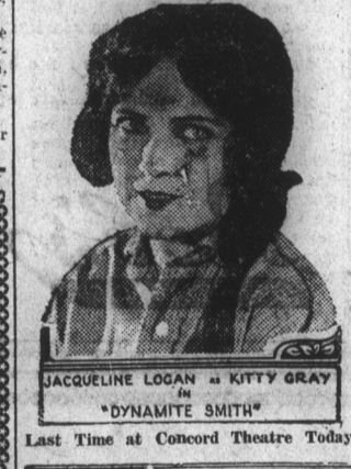
JACQUELINE LOGAN as KITTY GRAY in "DYNAMITE SMITH" Last Time at Concord Theatre Today.