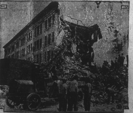
Santa Barbara is hard at work repairing the devastation wrought by her earthquake. This picture shows workmen busy on the ruins of the San Marcos building, which was one of the largest in the city.