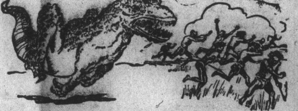
In shape they were like horrible toads, and moved in a succession of springs.

I write this from day to day, but I trust that before I come to the end of it, I may be able to say that the light shines, at last, through our clouds. We are held here with