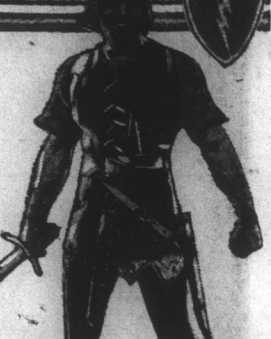
DOUGLAS FAIRBANKS IN 'ROBIN HOOD' Concord Theatre Last Time Today.