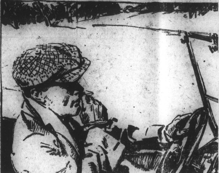
Camels contain the very choicest tobaccos grown in all the world. Camels are blended by the world's most expert blenders. Nothing is too good for Camels. In the making of this one brand we concentrate the tobacco knowledge and skill of the largest organization of tobacco experts in the world. No other cigarette made is like Camels. They are the overwhelming choice of experienced smokers.

BOWLING ALLEYS OPEN NEXT SEASON If You Are Planning Attractions Look Over the "Y" Date Book and Avoid Conflicts