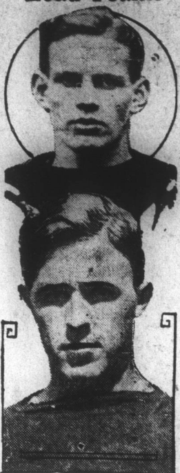
Here are the captains of two of the best football teams in the country...