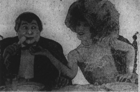
WILLARD LOUIS and LOUISE FAZENDA in "HOGAN'S ALLEY," A Warner Picture CONCORD THEATRE FRIDAY AND SATURDAY