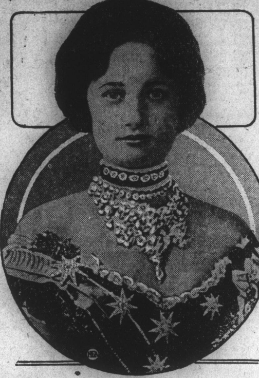
This composite photograph shows the jewels that Princess Astrid of Sweden will wear if, as reported, she becomes the bride of the Prince of Wales. They belonged to the prince's grandmother, the late Dowager Queen Alexandra, and in her will she left them to his wife—should he ever marry.