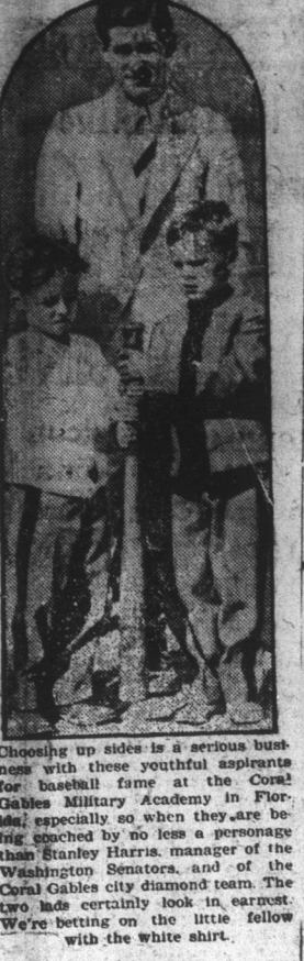
Choosing up sides is a serious business with these youthful aspirants for baseball fame at the Corral Gables Military Academy in Florida, especially so when they are being coached by no less a personage than Stanley Harris, manager of the Washington Senators, and of the Corral Gables city diamond team. The two lads certainly look in earnest. We're betting on the little fellow with the white shirt.