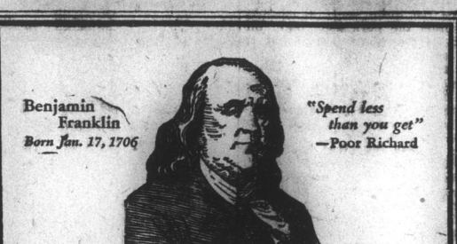
Benjamin Franklin "Spend less than you get" —Poor Richard