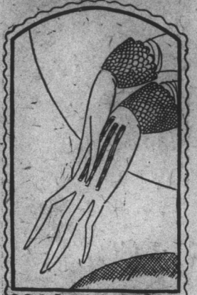
Snake skin is seen quite frequently on the new sport hats, bags and belts. This picture shows its novel application in the cuffs of these suede gloves.