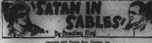
"Satan in Sables" with Lowell Sherman is a pictorialization of this novel.

"I would take pills until I was worn-out with them. I didn't seem to get relief. After taking the pills my bowels would act a couple or three times, then I would be very constipated."