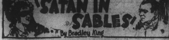
"Satan in Sables" with Lowell Sherman is a picturization of this novel.

Missouri's Indivertion. Charlotte Observer. Missouri's capture of the Italian government was a daring feat and was accomplished at possible development of a revolution, but he moved too