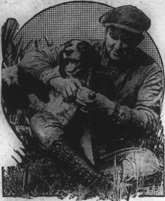
Ty Cobb, famous player-pilot of the Detroit Tigers, keeps in shape during the off-season. One of his favorite sports is hunting. Here he's showing bandaging the paw of his pet dog after it had picked up a briar.