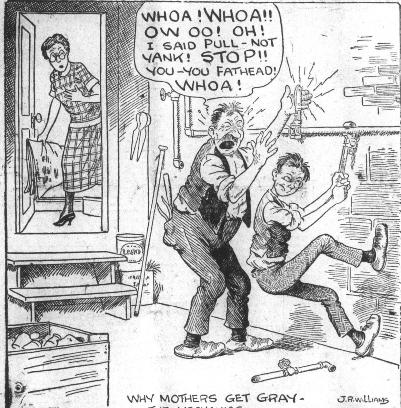
WHY MOTHERS GET GRAY - THE MECHANICS