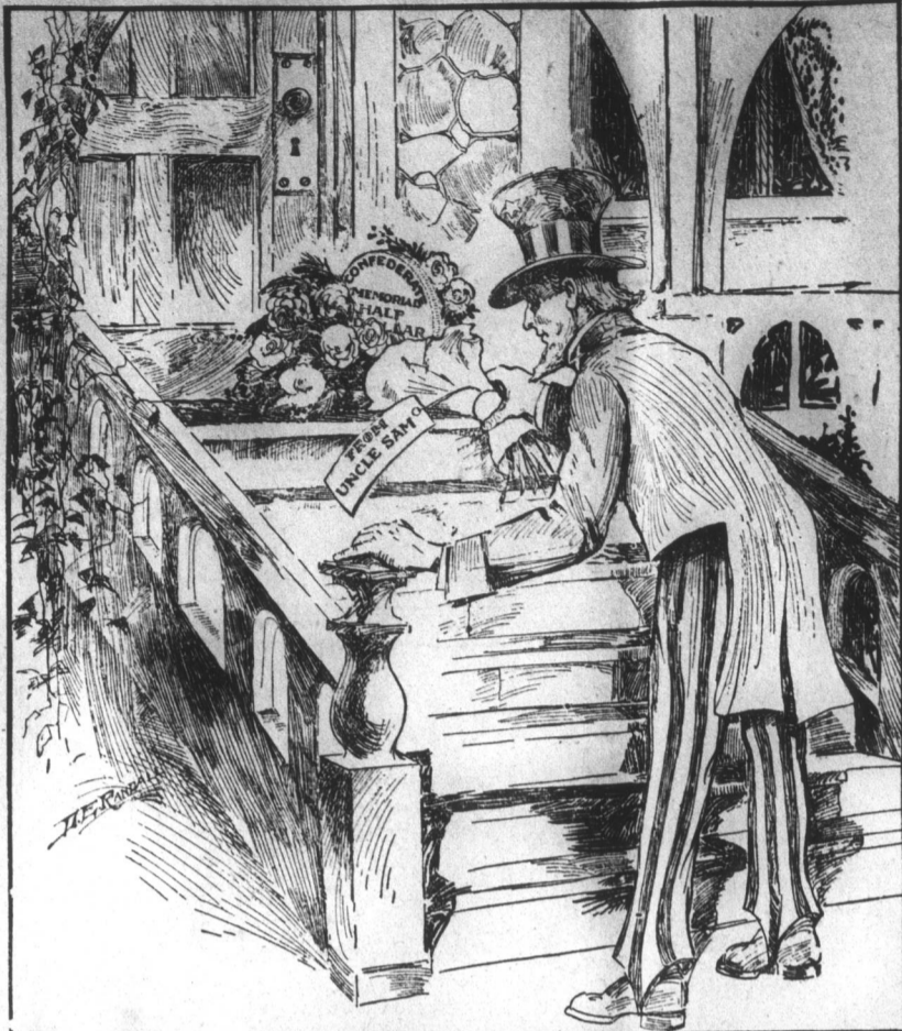
A beautiful decoration of valor in honor of our fathers is placed on our threshold by a great and generous government. Will we take it in and cherish it or leave it there to wither and die?