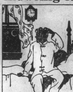
WORRYING ABOUT GETTING TO SLEEP NEVER HELPS

son this is bad, as it makes them conscious of the heart's action. Therefore, a good plan is to lie on the left side until drowsiness comes, and then turn on the right side. The circulation may be affected by lying in a cramped-up position in bed, and this may retard sleep. It is best to sleep with the body straight and relaxed, and without any consciousness of weight or strain, and not too much bed covering as due to its weight it is a hindrance to sleep. The body should create its own heat, and if a normal amount of coverings are used and found insufficient, it is better to remedy this condition by improving the circulation than by the added number of blankets. Regardless of the hour at which we retire, we should rise at the same hour every morning in order to be properly tired for the next night's sleep, and after mental work during the day there should be some mild recreative physical work in the evening—not too much, as an over-tired body is similar to being nervously fatigued and will have a tendency to keep one awake.