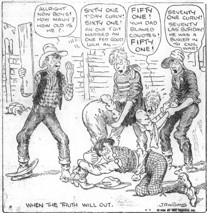
WHEN THE TRUTH WILL OUT.