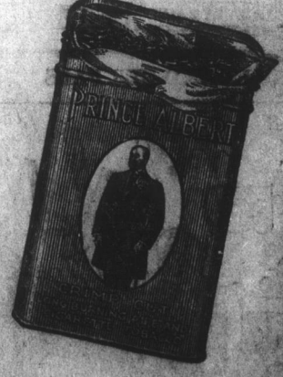
P. A. is sold everywhere in tidy red tins, round and half-round tin tins; and round crystal-glass humidor with sponge-insulation top. All sizes with every bit of bite and parch removed by the Prince Albert process.

it any way you please . . . slow or fast, morning to midnight! Yes, sir! P. A. is the taste-teasingest, tongue-pleasingest tobacco that ever tumbled into a briar. Its smoke is the coolest that ever sifted into your system. Its fragrance keeps honeysuckle and your favorite rose fighting for second place. Put it on your pad now: You've got a date this very day with the smoke-shop that hands out P. A. sunshine in tidy red tins. Decorate yourself with the degree of P. A., and get the highest degree of pleasure out of that old pipe.