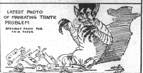
LATEST PHOTO OF MANEATING TRAFFIC PROBLEM SPECIALLY POSED FOR THIS PAPER.