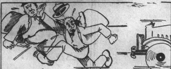
RULE SIX PEDESTRIAN MUST SLOW DOWN TO A RUN