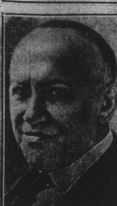
Carl Laemmle, American movie magnate, was taken seriously ill in London.

NO EXTENSION OF TIME Will Be Granted Auto Owners—You're Safe if You Made an Effort.