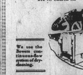
FOREST HILL CLEANING CO. 316 N. Church St. Phone 175-J

THE secret of our success in dry-cleaning is the equipment we use—the BOWERS Continuous-Flow System, a modern, odorless, sanitary system that gives splendid results in all kinds of dry-cleaning.