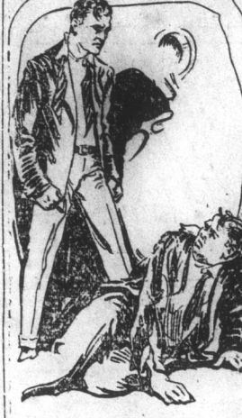
"You silly ass," said Tony staggering to his feet and wet to the skin.

And so it was very far from easy, hard and fit as Tony was. He had not expected this sudden onslaught.