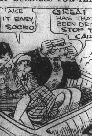
© 1927, by King Features Syndicate, Inc. Used by permission.