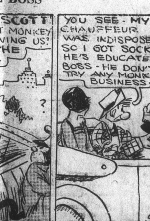
© 1927, by King Features Syndicate, Inc. Used by permission.