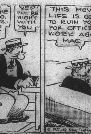
© 1927, by King Features Syndicate, Inc. Used by permission.