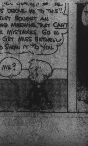
(1927) by King Features Syndicate, Inc.