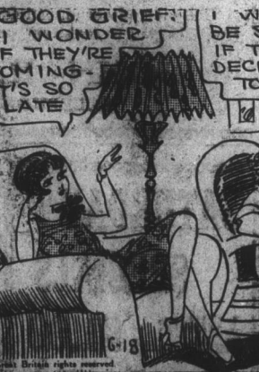
(1927) by King Features Syndicate, Inc.