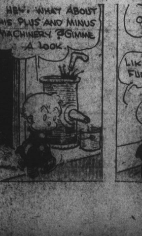
(1927) by King Features Syndicate, Inc.