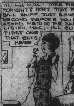
(1927) by King Features Syndicate, Inc.