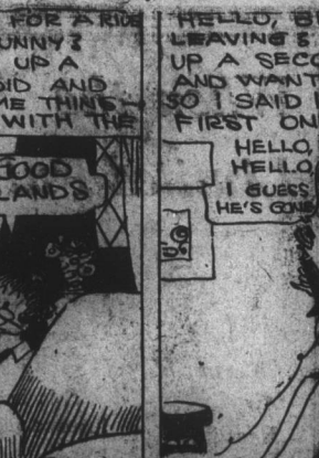
(1927) by King Features Syndicate, Inc.