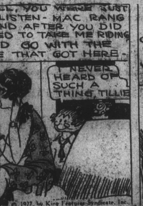
(1927) by King Features Syndicate, Inc.