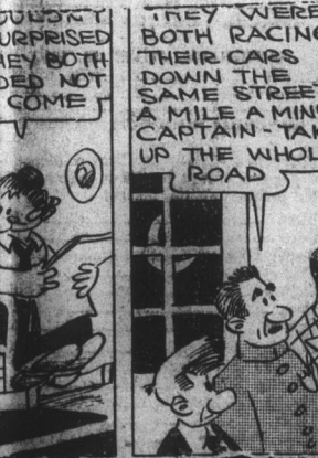
(1927) by King Features Syndicate, Inc.