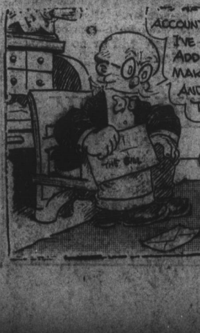
(1927) by King Features Syndicate, Inc.