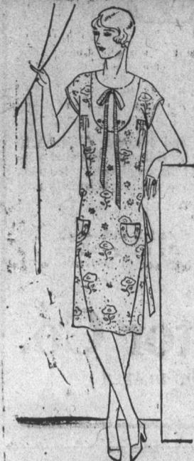
A Colorful Morning Frocks For Summer Wear.

In these days there is no excuse for the busy housekeeper not to look her charming best, for the simple inexpensive cotton frocks solve her house dress problem to perfection.