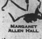
MARGARET ALLEN HALL

Bacon, eggs, toast, cereal. Mighty good for breakfast, but don't we sometimes get tired of them?