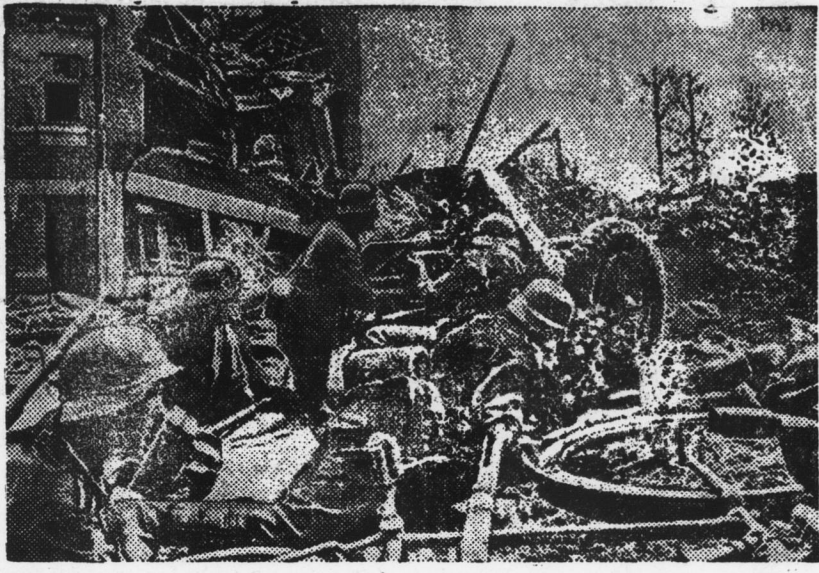
FRANCE . . . Light German anti-aircraft troops have settled down in the ruins of an unidentified town, waiting to fire on the enemy. Great destruction is everywhere in evidence as a result of bombing raids and shell fire.