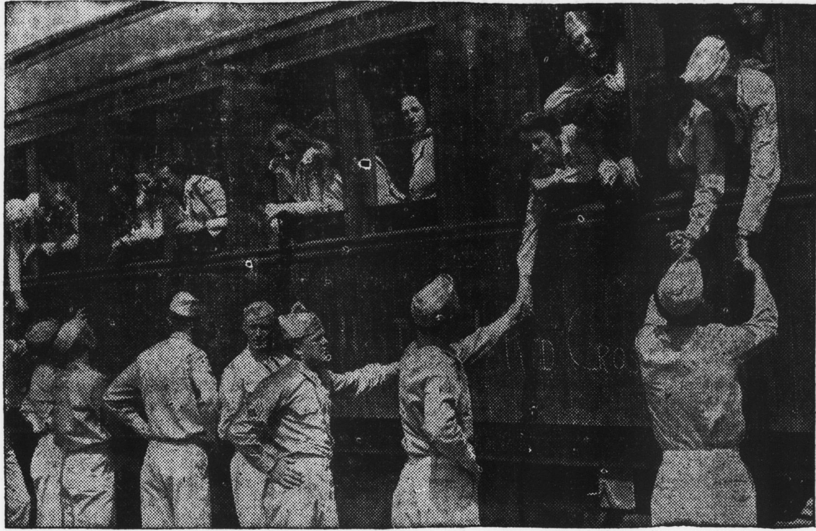
Wishing Red Cross girls goodbye are these soldiers stationed in North Africa. The Red Cross workers are leaving a base in North Africa on the first leg of a journey to distant posts.