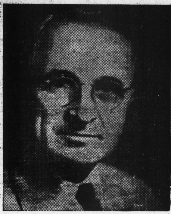
HARRY S. TRUMAN