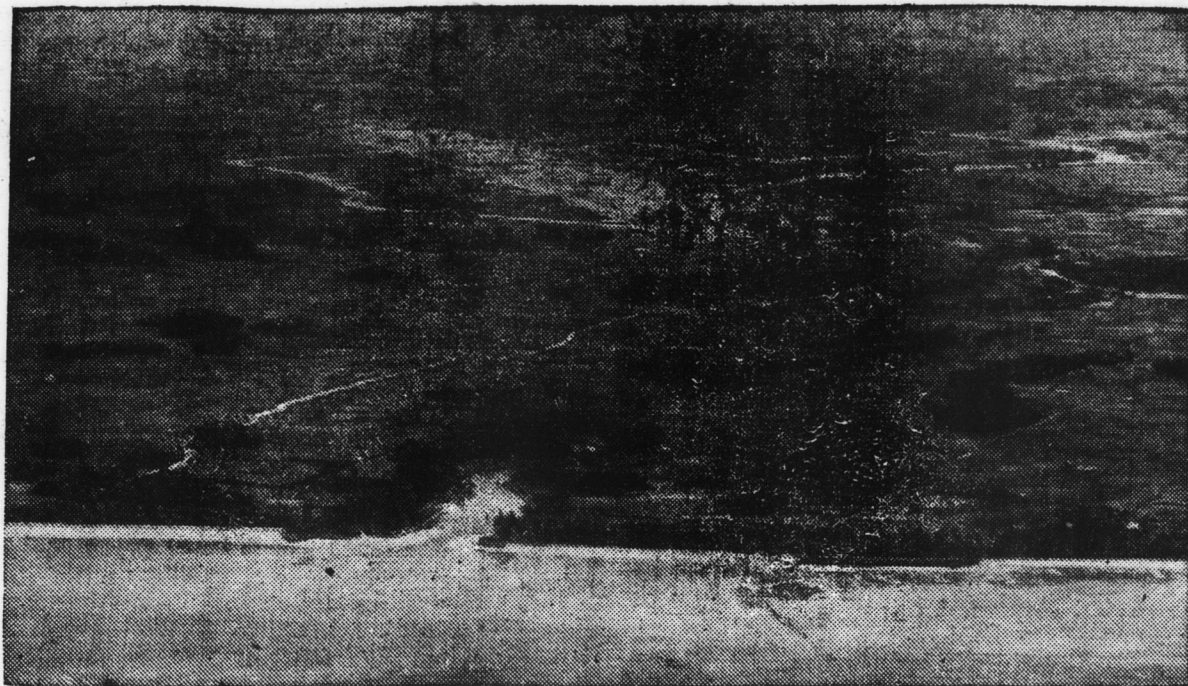
A mile from the shoreline, over a flat plain, Katana airfield stretches out its full 4,900 feet of coral landing strip. This field is 3 miles from Naha, "metropolis" of Okinawa.