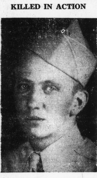
KILLED IN ACTION