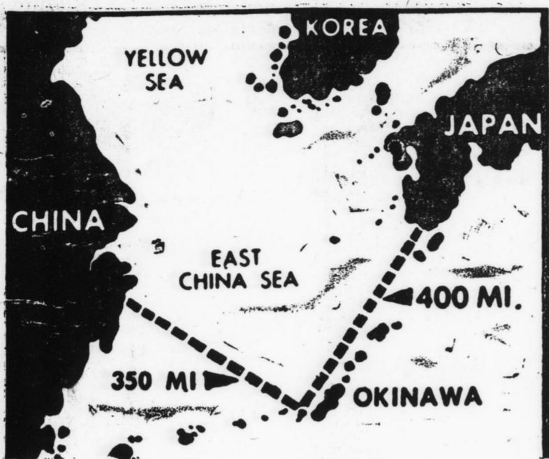
This map shows the U. S. Base at Okinawa, from which Japanese cities are being shelled at will with little resistance.