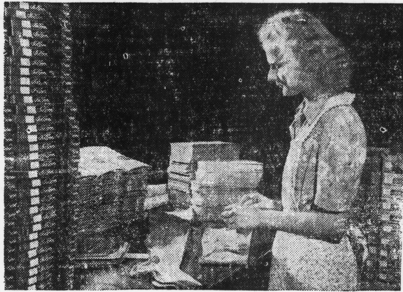
You can stop dreaming about the nylons you are planning to buy. Very soon you can go out and make that dream a reality. This scene is in a hosiery mill in Philadelphia, showing the finished nylons folded and boxed, ready for shipment.