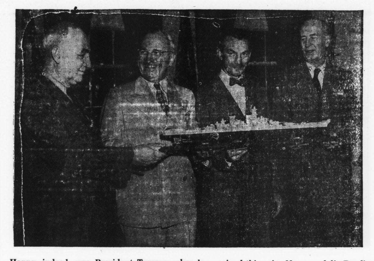
Happy, indeed, was President Truman when he received this prize Navy model! Reading from left to right: Vice Admiral Randall Jacobs, President Harry S. Truman, Secretary of Navy James Forrestal, Fleet Admiral Ernest J. King.