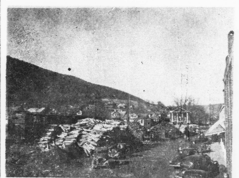
Here is a typical scene on Railroad street showing the large amount of extract wood being brought here by truck to be shipped out by rail. It is estimated that 100 carloads have been shipped out of West Jefferson since January 1.