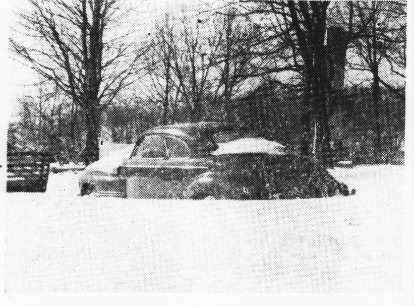
But we doubt if many motorists who had to leave their cars parked sang the song as they walked. The above scene shows the depth on College Avenue.