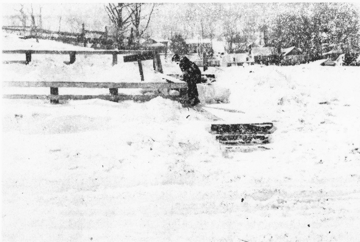
Here snow is being removed from the steps leading to the Norfolk and Western railroad station. Shoveling snow has not only been a favorite sport for most people here during the past two weeks, but has been a necessity as well, provided they wanted to get in and out of their homes and places of business.